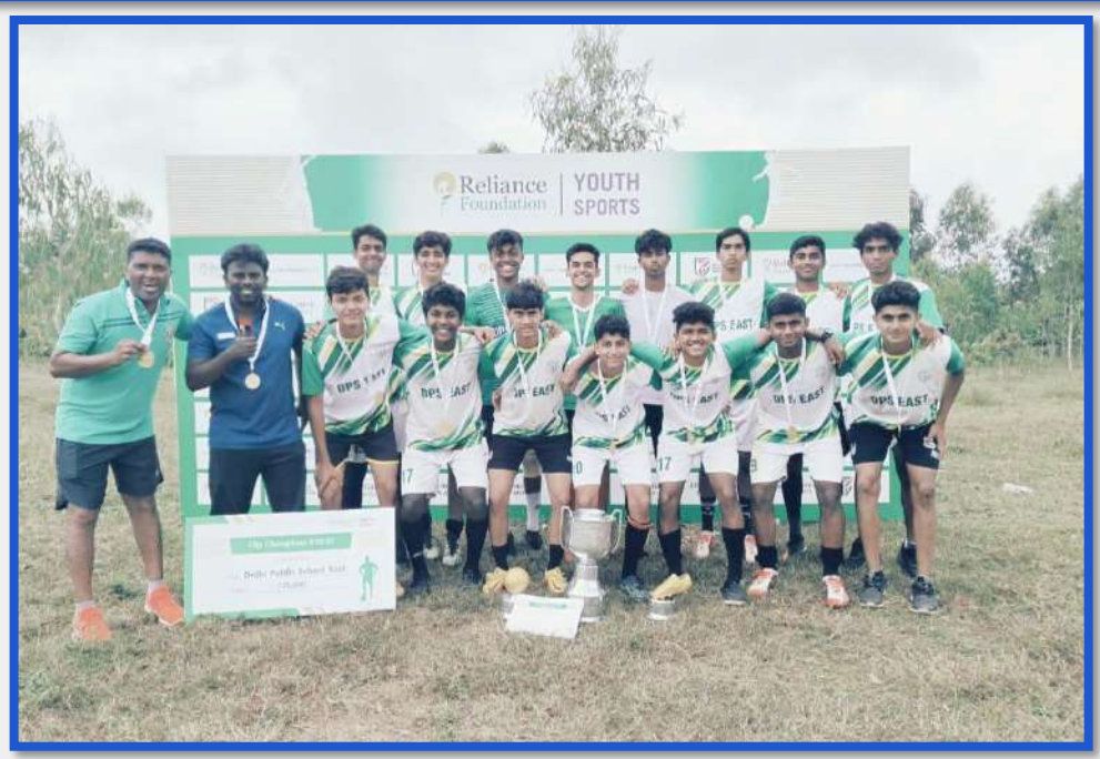
Congratulations to all the team members!!!