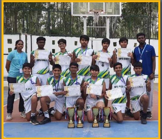
Under 14 (Boys)