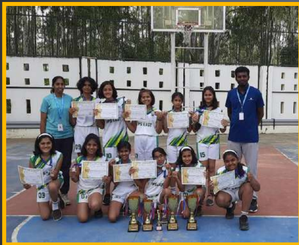
Under 12 (Girls)