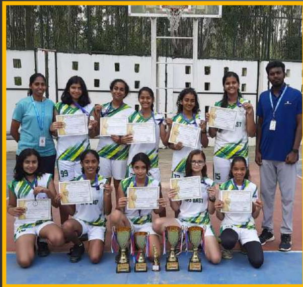
Under 14 (Girls)