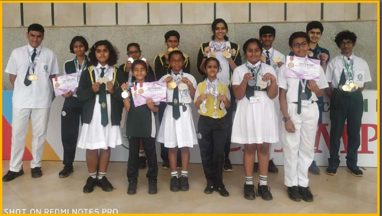
SHOT ON REDMI NOTE5 PRO